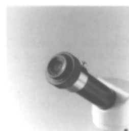
MA210D Zoom Eyepiece