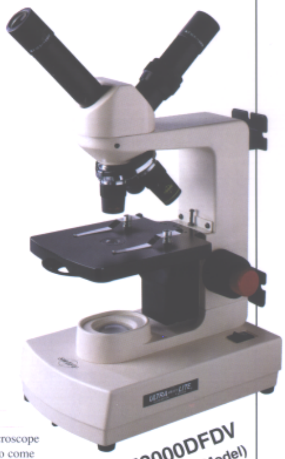
M2000DFDV (Dual-View Model)