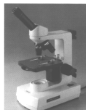
M2000DFMN (Monocular Body)