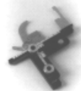
MA889A Mechanical Stage