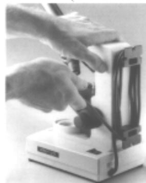
New Cord Hangers